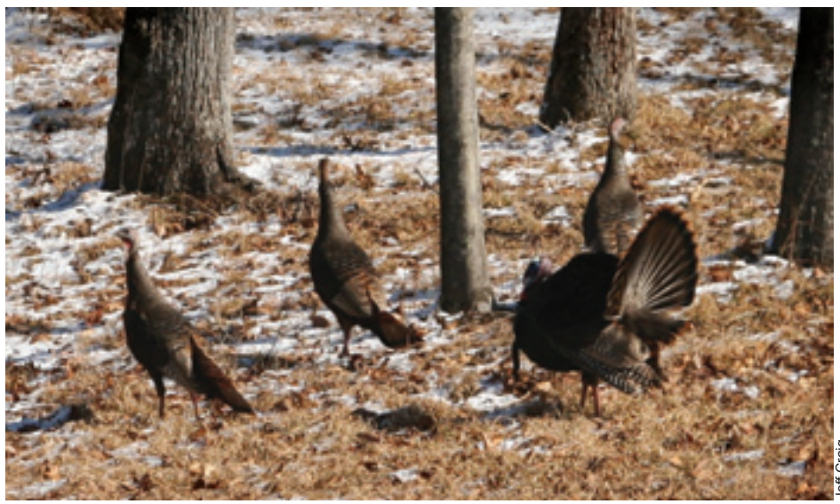
Wild turkeys can be exposed to the parasite that causes the Blackhead disease if eating from an infected food source. It is better for them to depend on wild food sources.

Campers should lock coolers in their vehicles or hang food in a food bag at least 10 feet off the ground