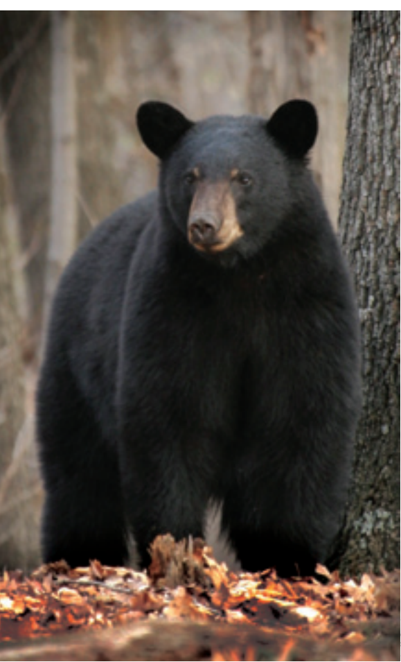
Bears become used to receiving hand-outs and lose fear of humans.

in feeding situations. In many cases, habitat can be improved and managed to sustain more wildlife. There is no shortcut to provide this habitat improvement. In most cases, feeding is an attempt at a